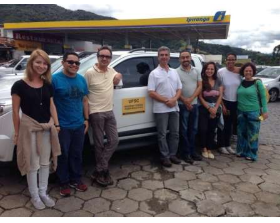
The group minus the photoghrapher

As a part of a subject offered by the Pharmacology Graduate Program from UFSC (PPG-FMC), graduate students and professors worked together during 4 months discussing topics about scientific popularization while developing activities intended to engage high school students in learning pharmacological topics. A group of 3 professors, 2 graduate and 4 undergraduate students spent 5 days at Coxilha Rica to apply the module created for the Imagine Project. Coxilha Rica is a rural neighborhood from the city of Lages and is located 80 Km away from downtown Lages. Lages is a city from Santa Catarina State, Brazil.